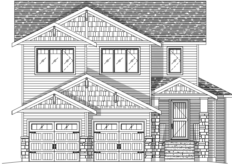
FRONT ELEVATION 161 SIXMILE BEND S.