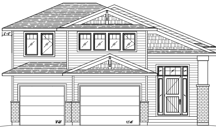
FRONT ELEVATION 2667 ELM DRIVE

Exclusive Property of NEUHAVEN DEVELOPMENTS INC Any Duplication in Whole or Part is Strictly Prohibited.